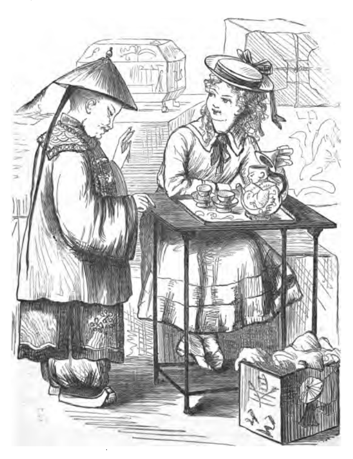
Fun signified in pantomime that they were hers. - Page 79.